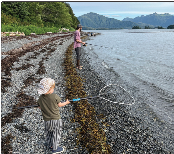
Fishing is a family affair.