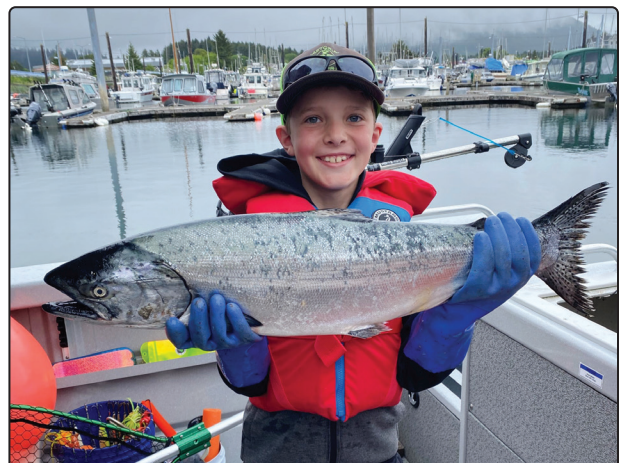
A beautiful Chinook salmon from Sitka Sound.