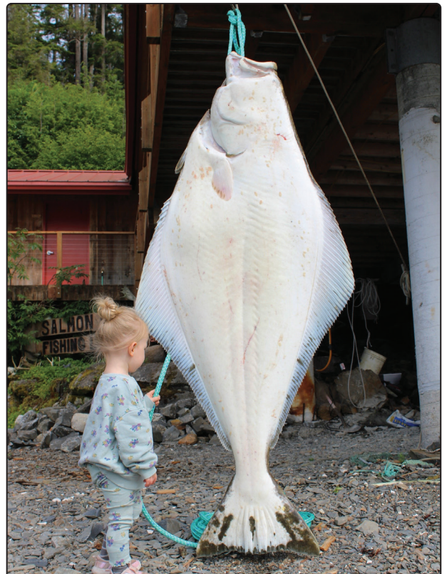
Toddler for size comparison.