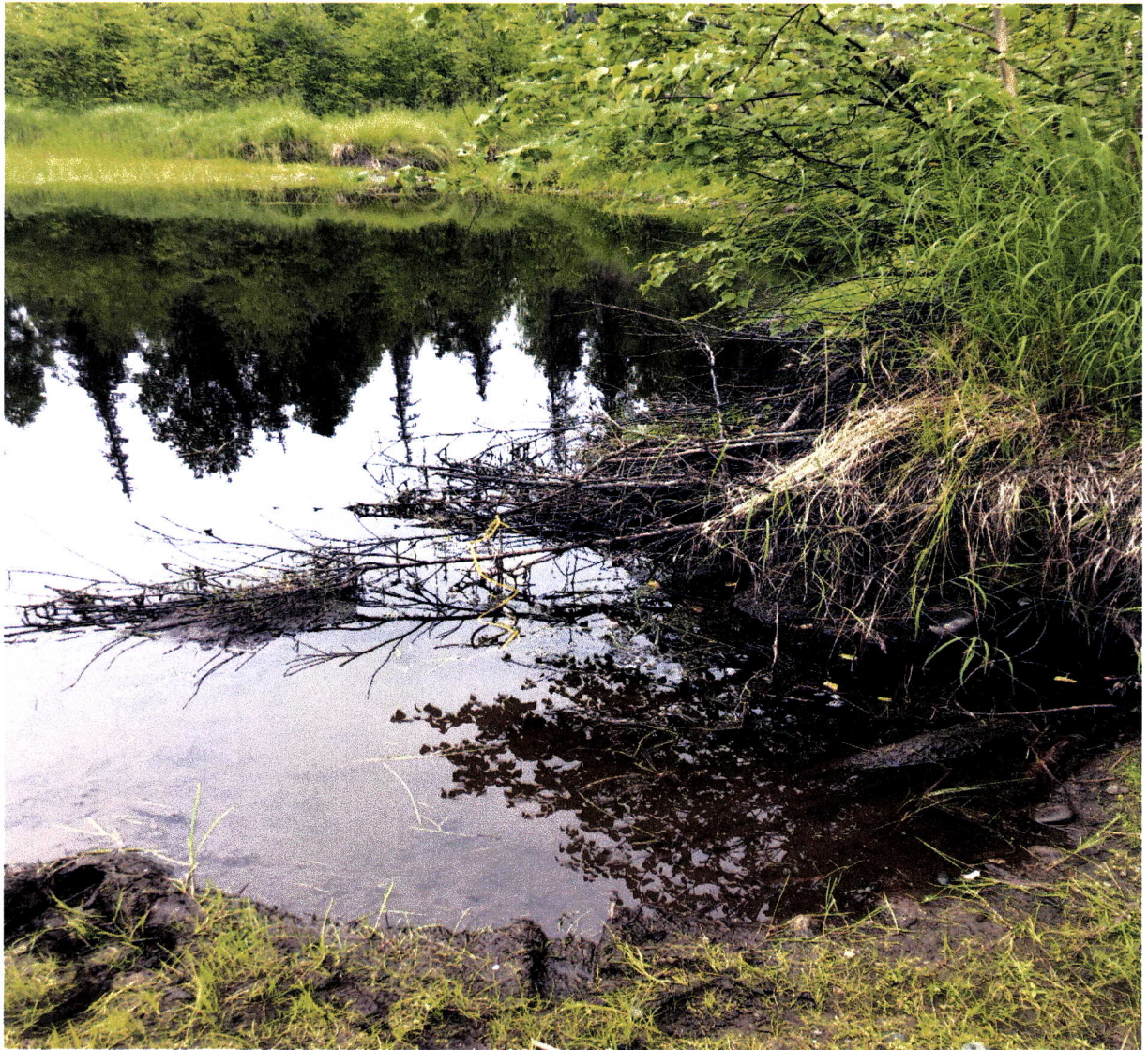
Trap site #1, where 9 coho salmon and 5 threespine stickleback were captured in a 2 hour soak.