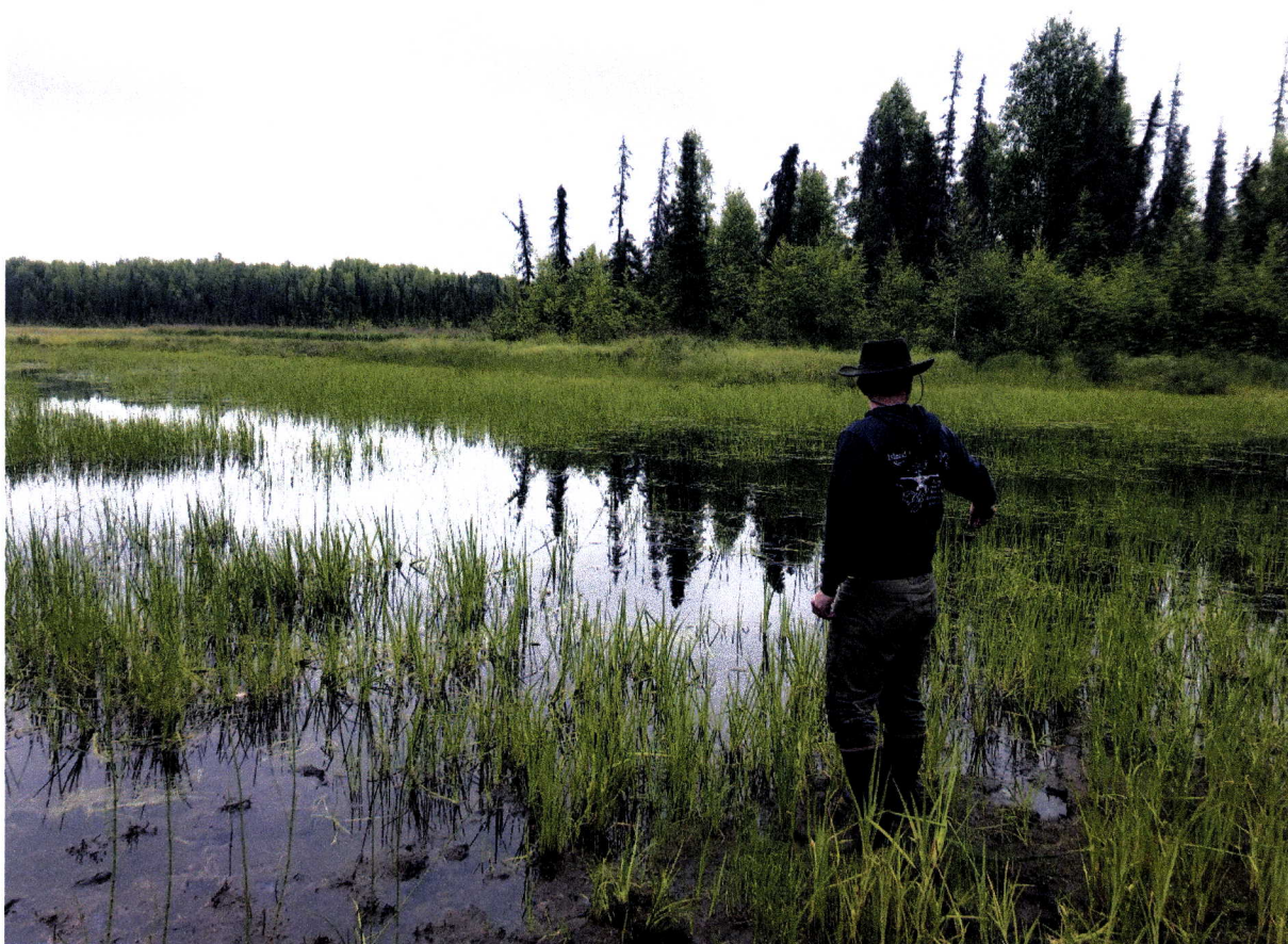
Beaver pond at uppermost extent of trapping effort.