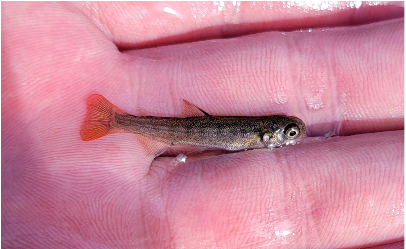
Figure 7.- Closeup of coho YOY captured at waypoint 7.