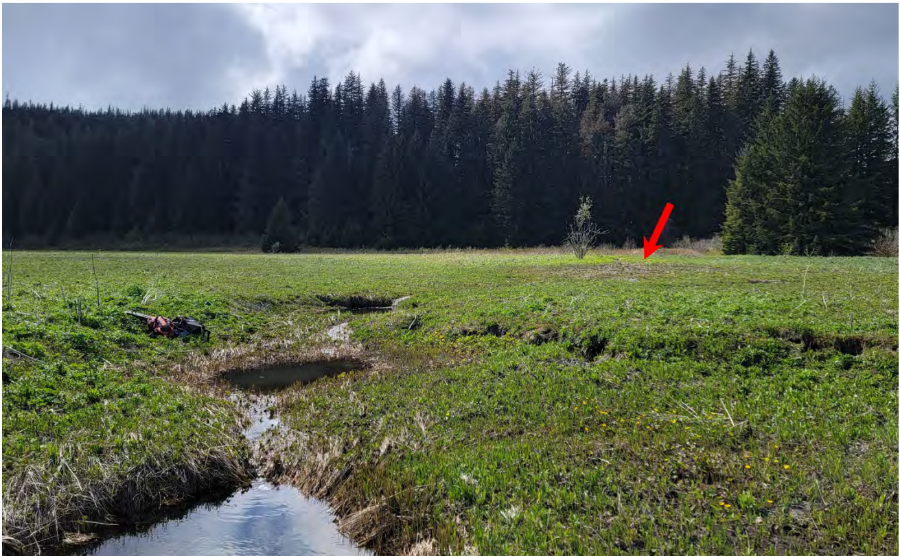
Figure 9.- Looking upstream in main channel at pools and grass steps from near waypoint 7. Red arrow indicates stream emergence from seep.