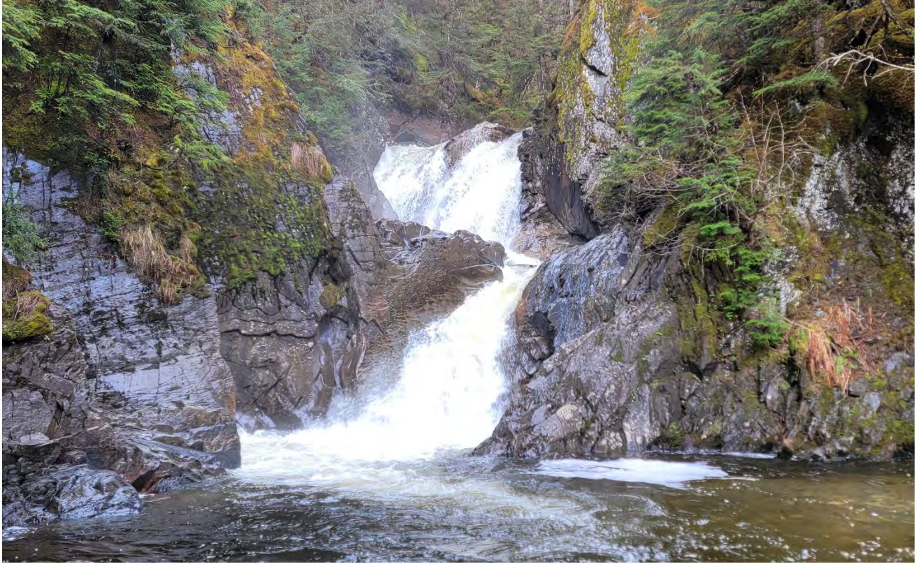
Figure 2.- 13.6m probable barrier to anadromy at waypoint 3.