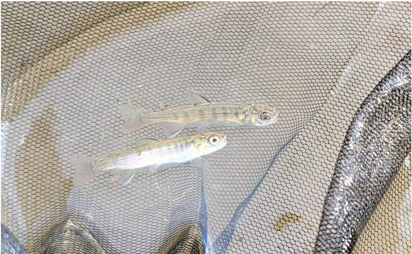
Figure 3.- Juvenile coho salmon captured in a previously unlisted tributary at waypoint 5.