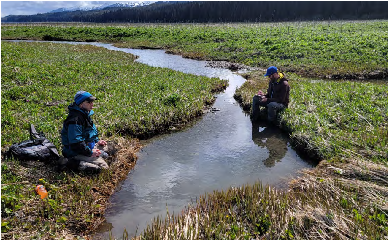
Figure 8.- Looking downstream from waypoint 7 showing off-channel pool where fish were captured as well as stream channel and general characteristics.