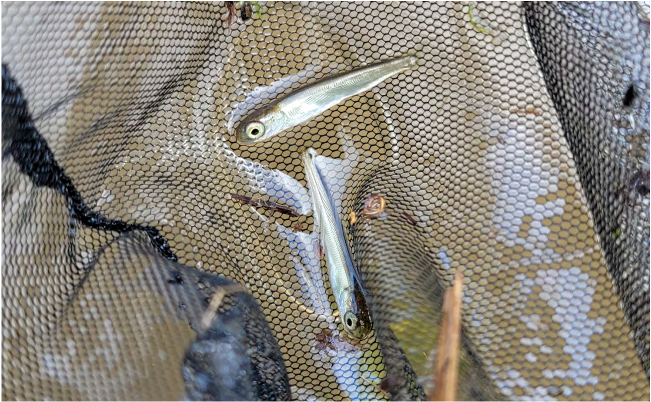
Figure 4.- Juvenile pink salmon captured in a previously unlisted tributary at waypoint 5.