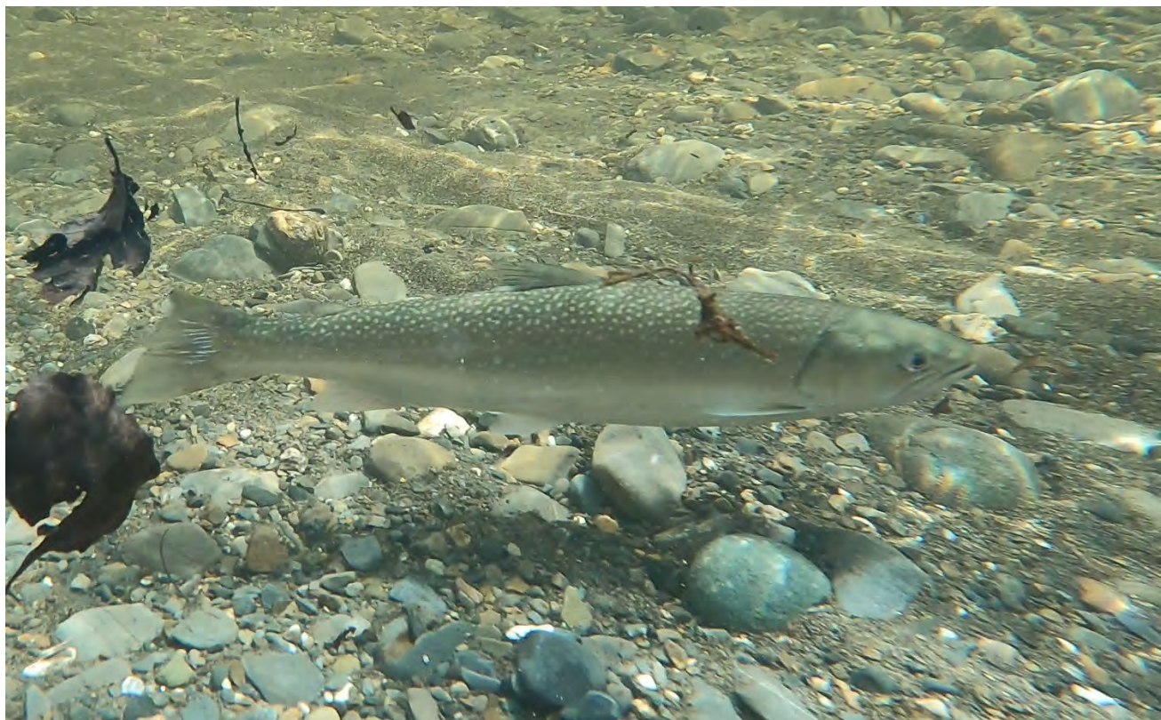
Figure 1.- One of two Dolly Varden char from waypoint 2. Size and appearance of both fish strongly suggest anadromy in recent life history.