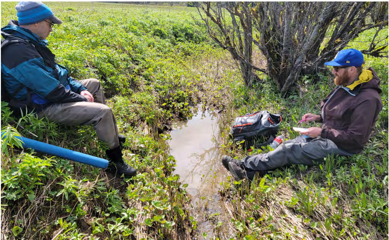
Figure 5.- Looking upstream at waypoint 5 showing emergence of flow at this water level and "dry" surface channel upstream.