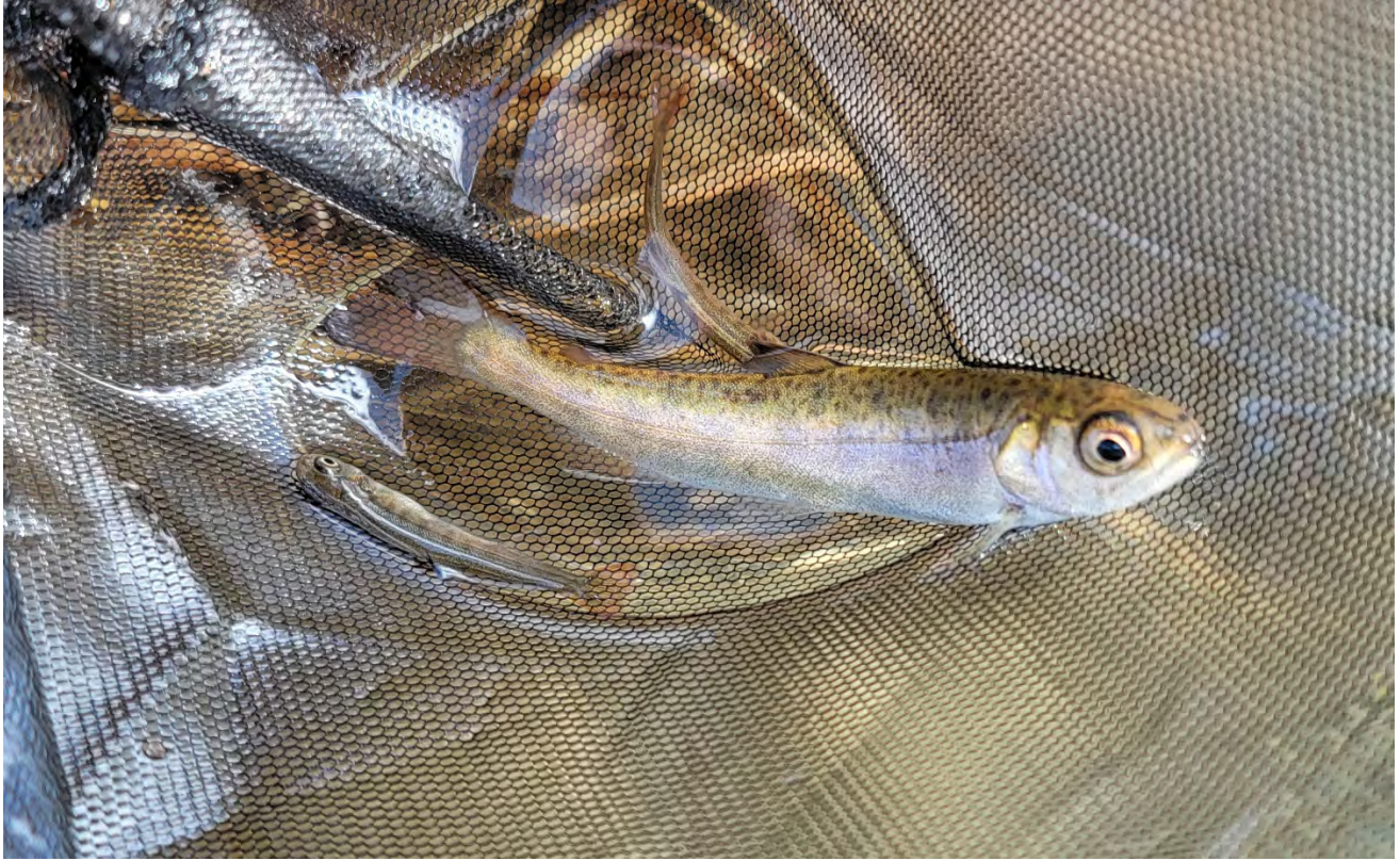
Figure 6.- Three juvenile coho salmon (Two YoY and one age 1+) captured in a previously unlisted tributary at waypoint 7.