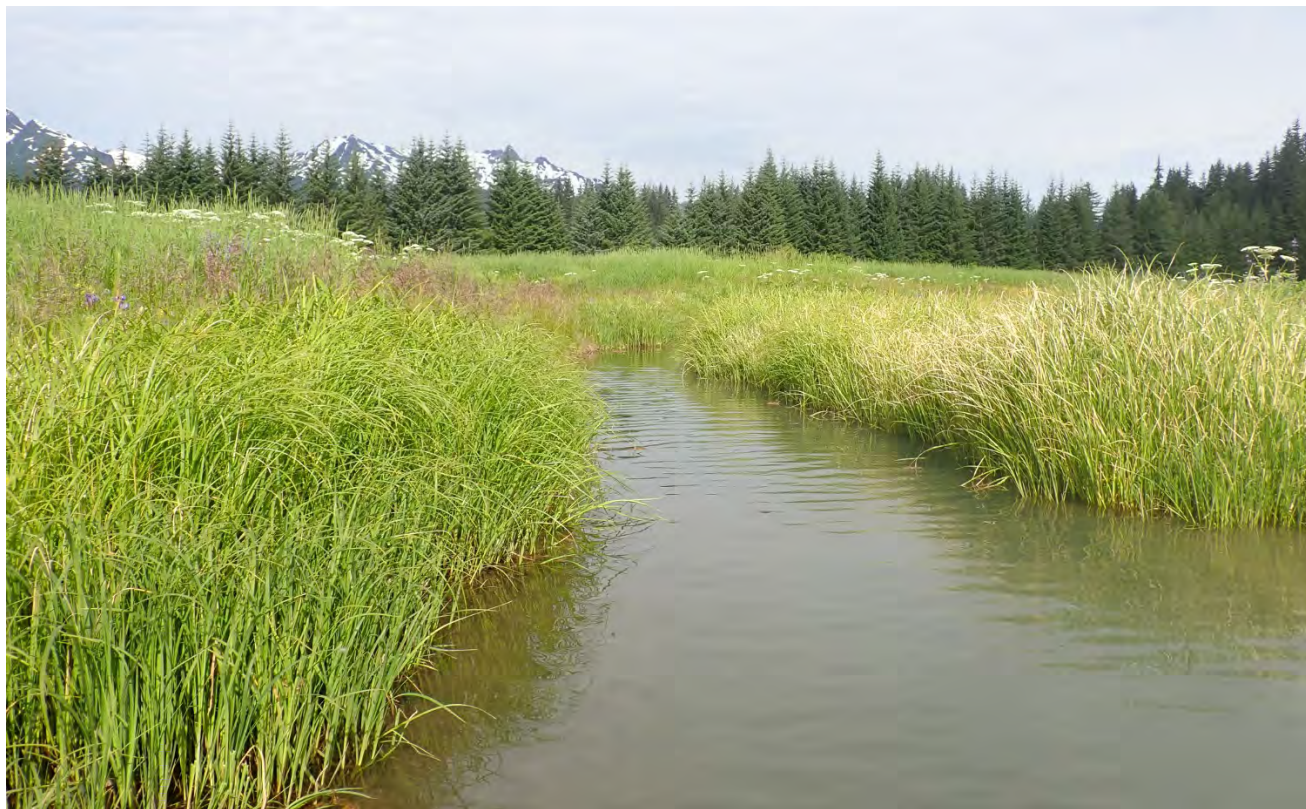
Figure 1. - Looking NW up 115-10-10440 from its confluence with 115-10-10460 at waypoint 1.