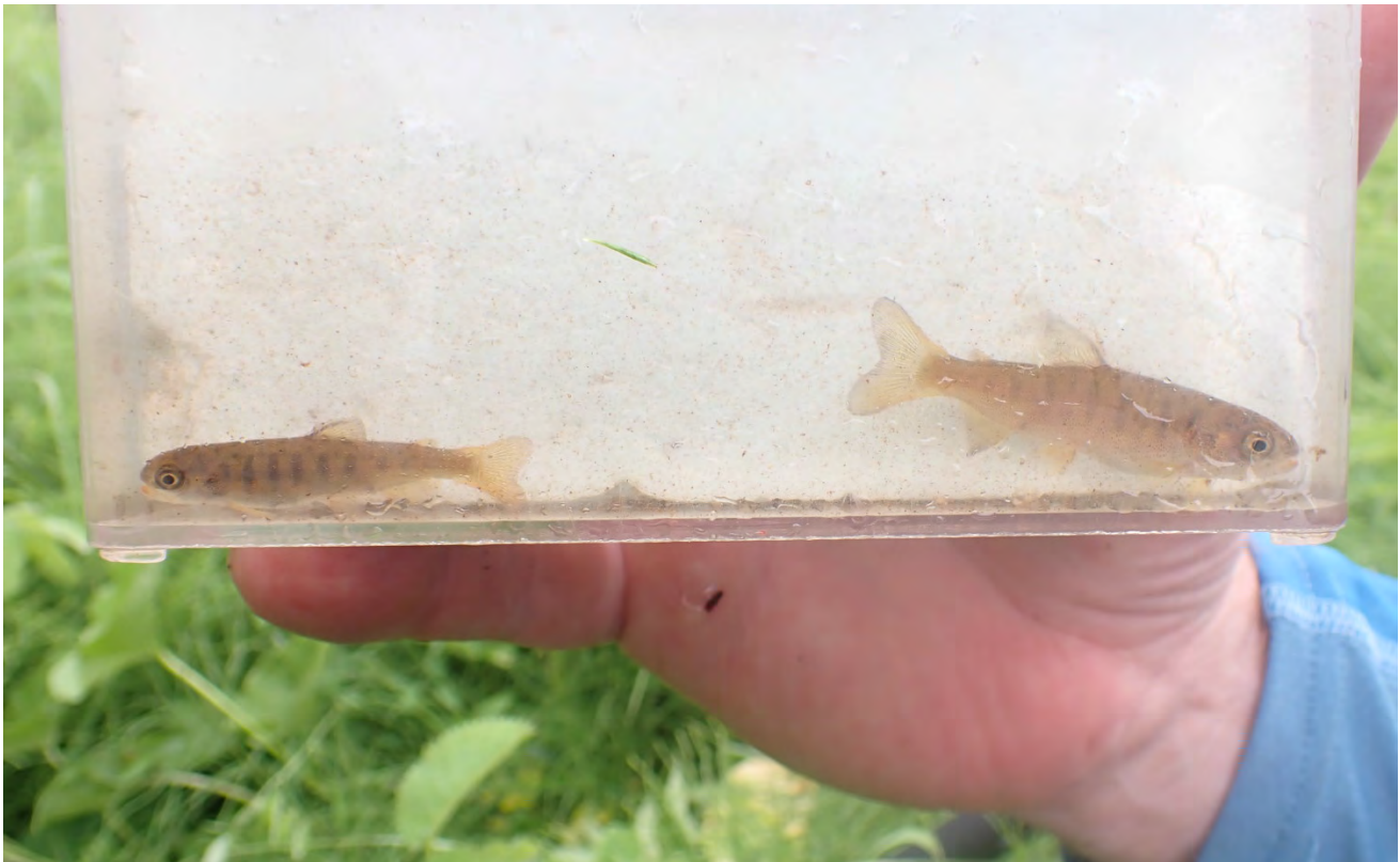
Figure 6.- Juvenile coho captured at waypoint 7.