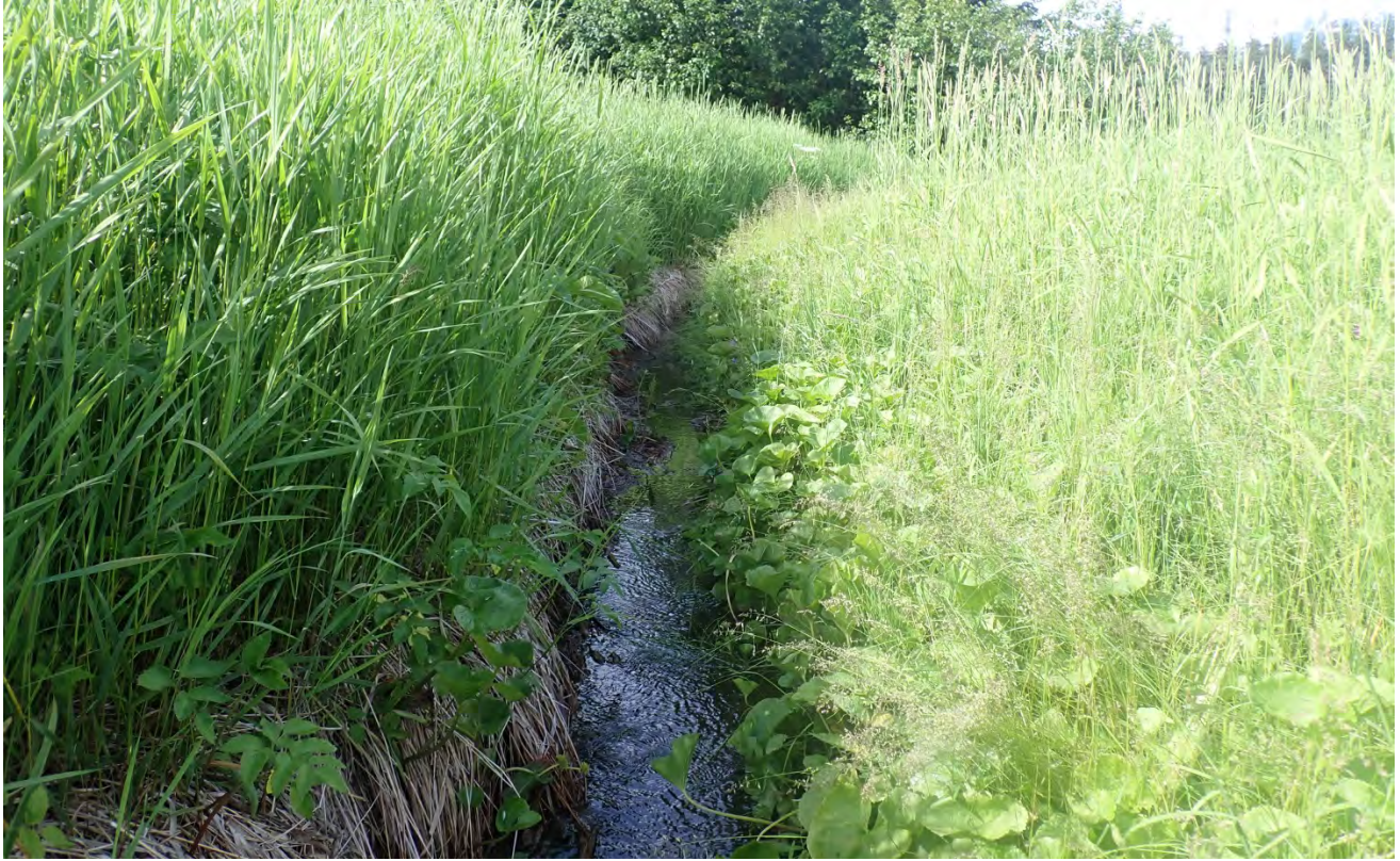
Figure 3.- Looking upstream from waypoint 3 at general stream characteristics encountered in this reach.