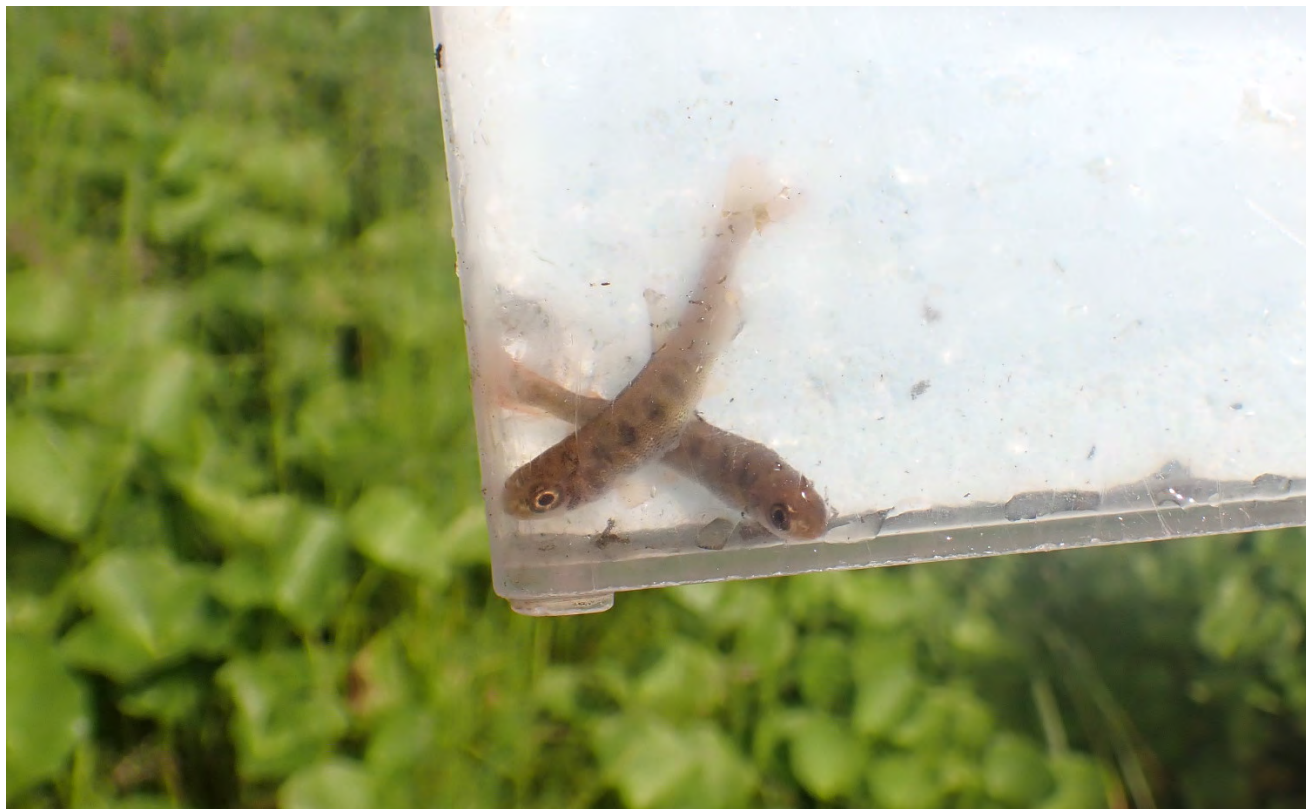
Figure 2.- Juvenile coho salmon captured at waypoint 3.