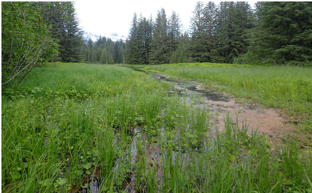
Figure 7.- Looking upstream from waypoint 8 at beaver pond. This pond also shares a hydrologic connection with 115-1010430.