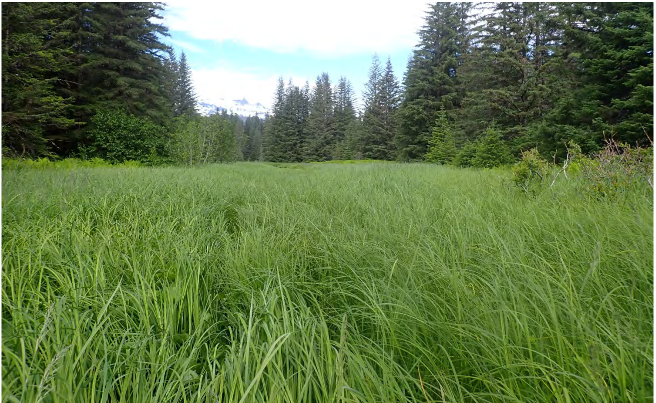
Figure 4.- Looking upstream from waypoint 6 at stream characteristics between here and beaver pond at waypoint 8.