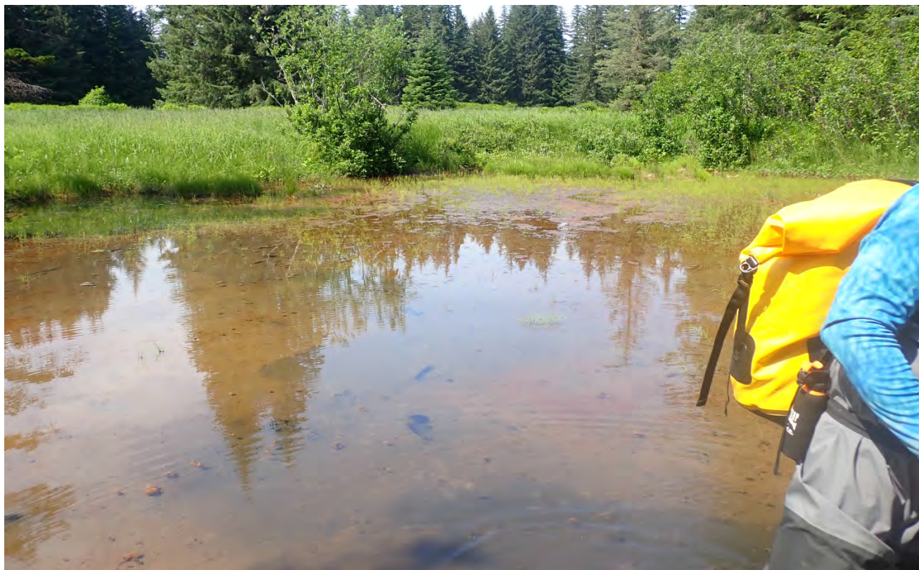
Figure 8.- Looking north from waypoint 11 at pond characteristics.