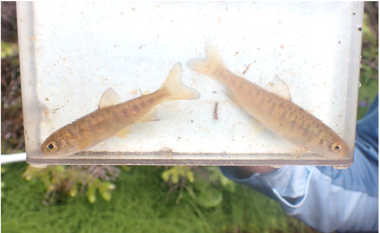
Figure 10.- Juvenile coho captured in pond at waypoint 12.