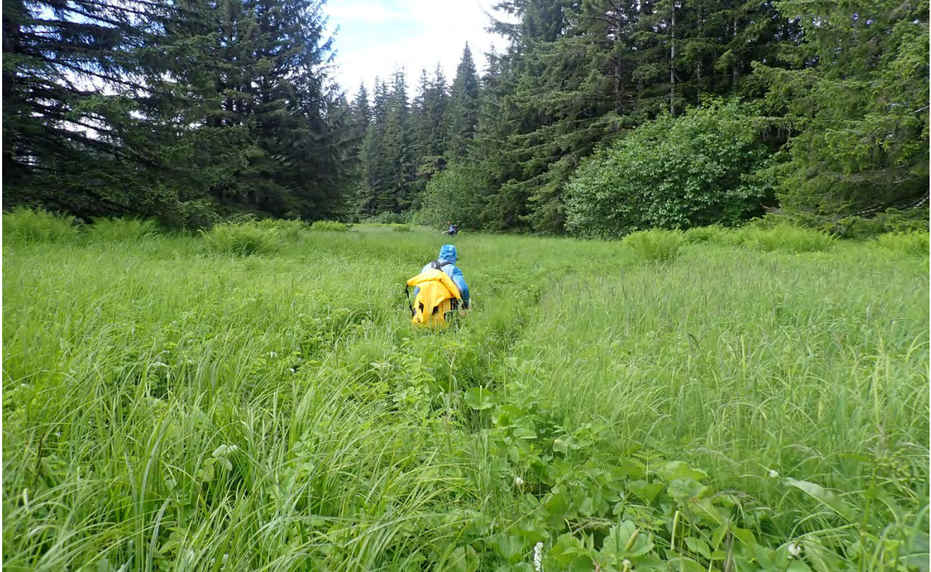
Figure 5.- Looking up tributary noted at waypoint 6. Waypoint 7 is between the two observers in the photo.