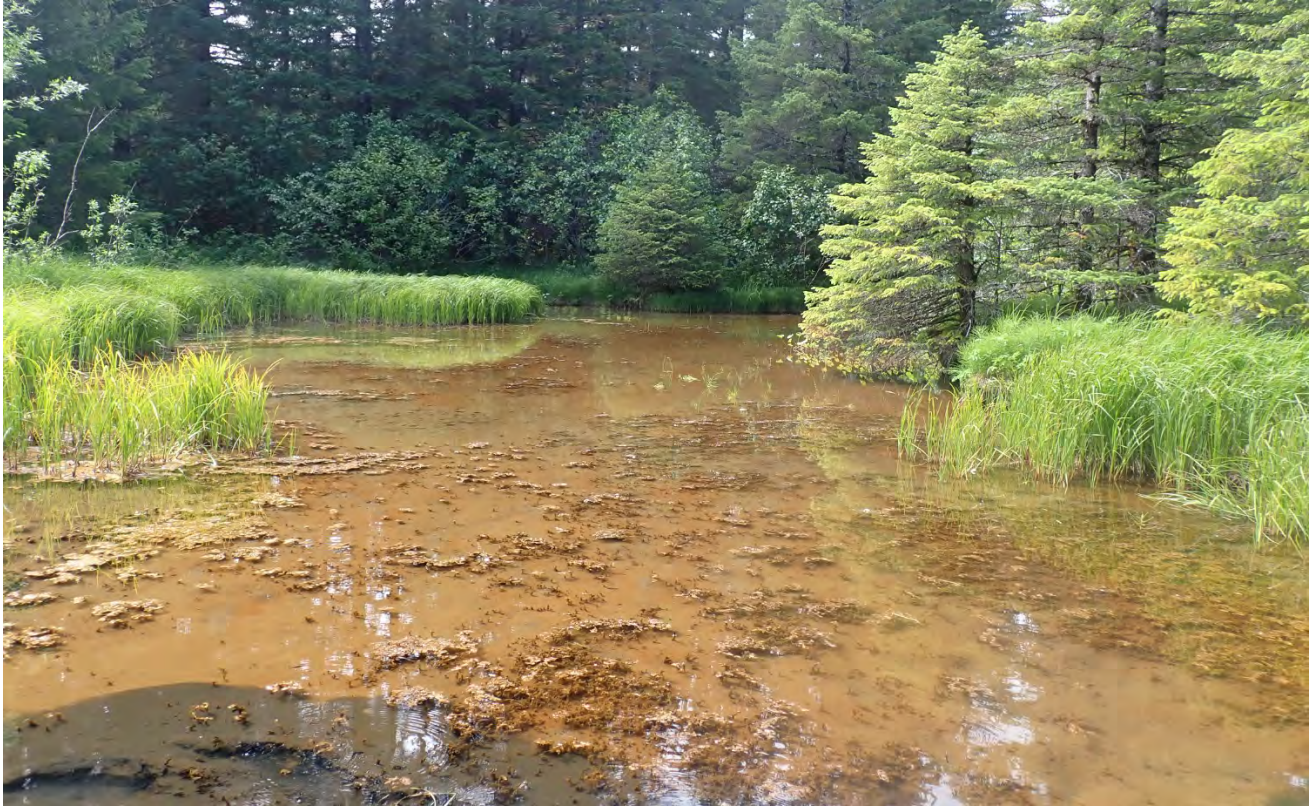
Figure 9.- Looking west from waypoint 12 at pond characteristics.