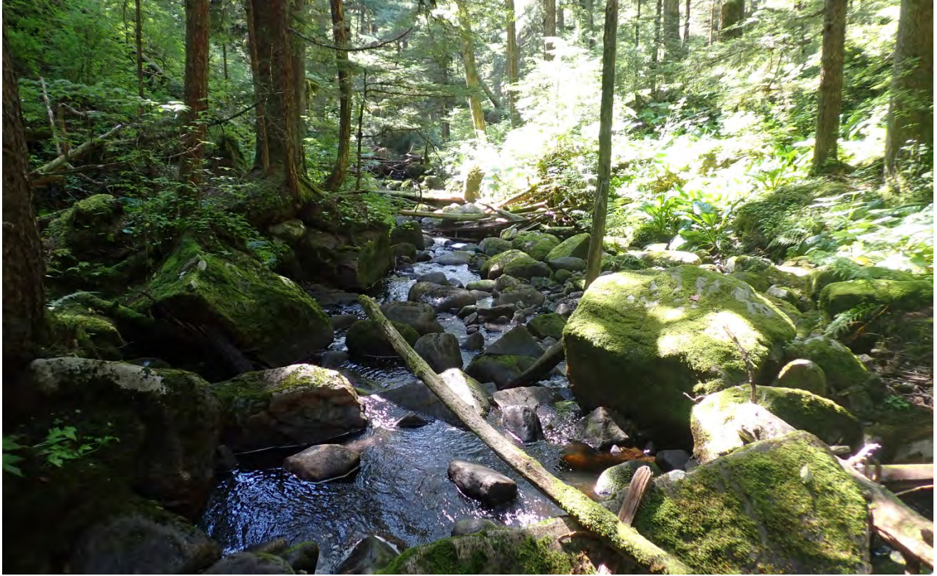
Figure 1.- Looking downstream from waypoint 6 at general stream characteristics encountered between waypoints 2-7.