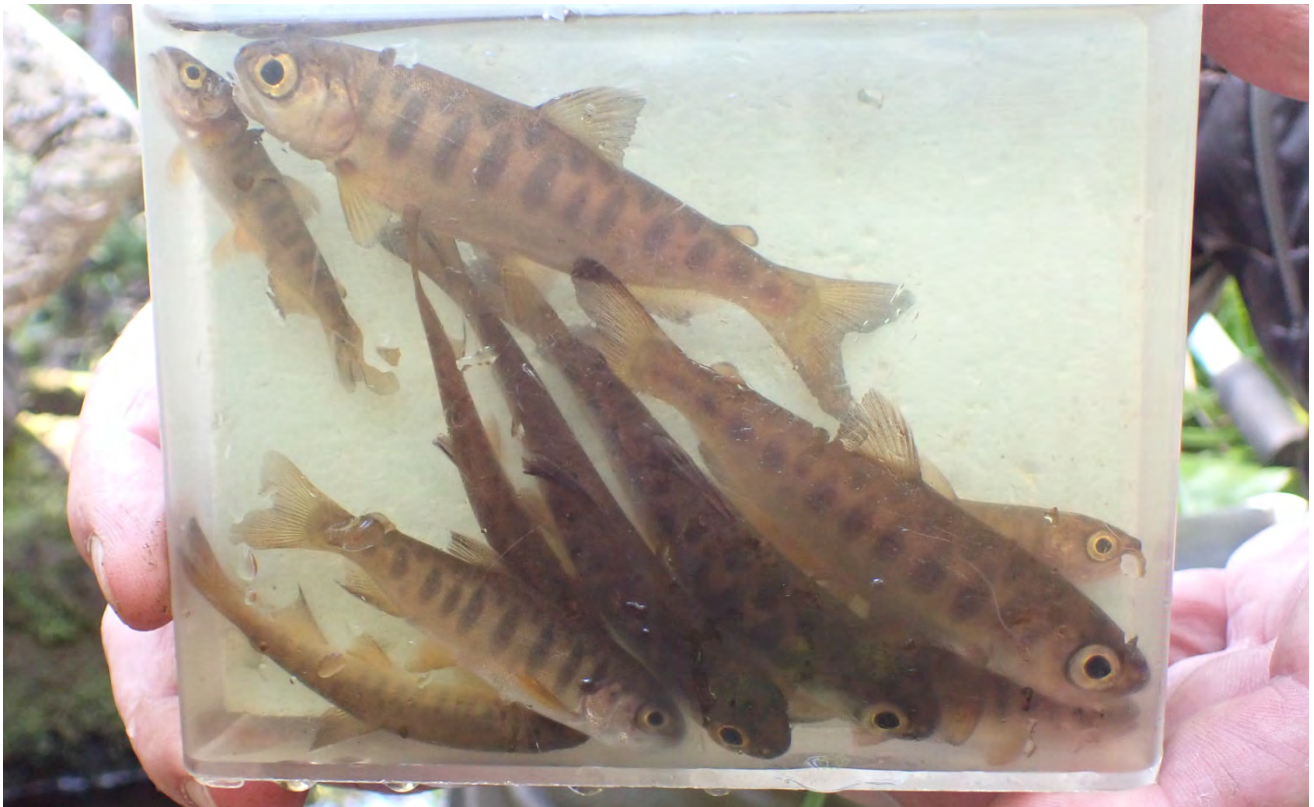
Figure 4.- Juvenile coho salmon captured at downstream of the beaver dam at waypoint 8.