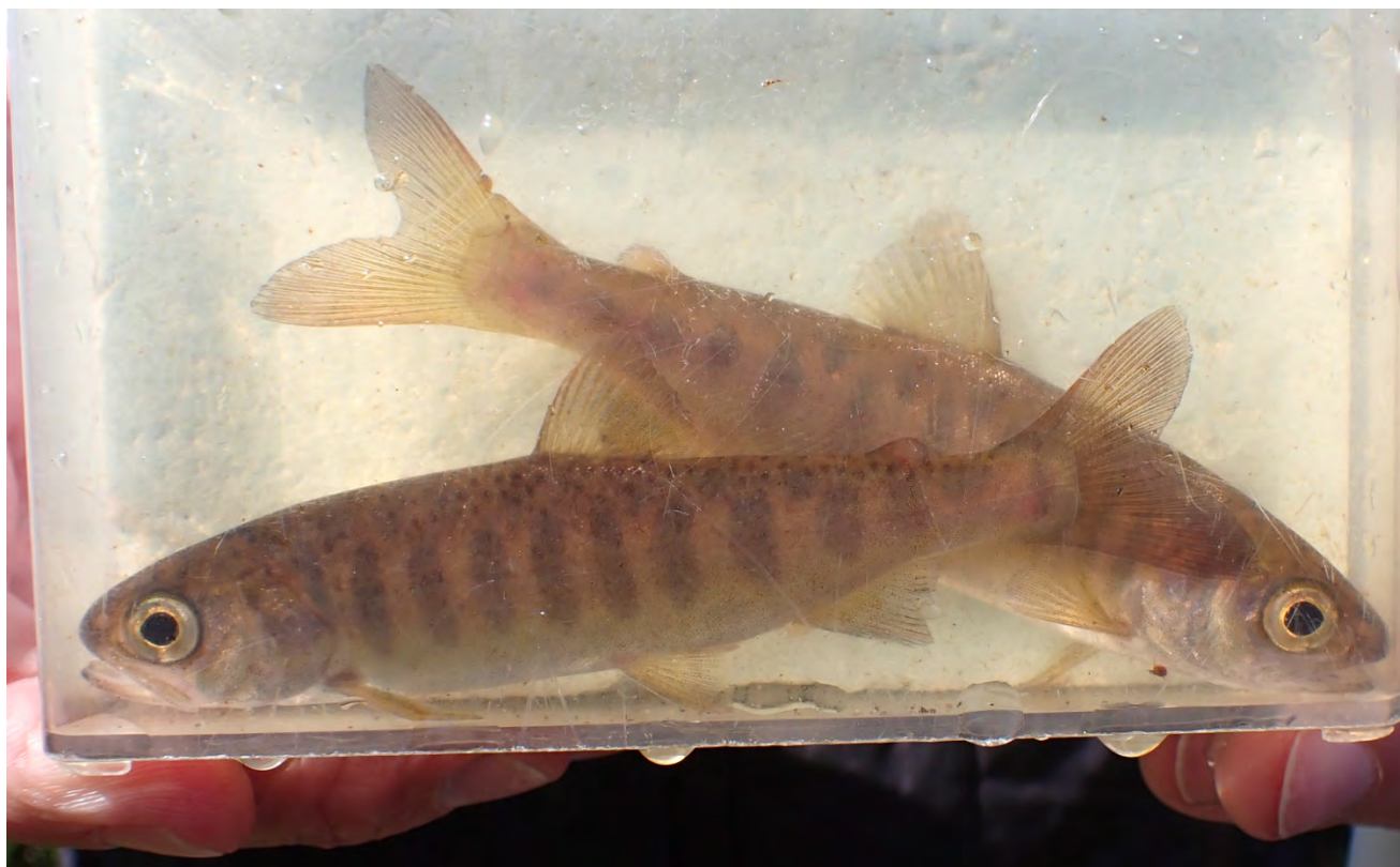
Figure 6.- Juvenile coho captured in the lake noted at waypoint 13.