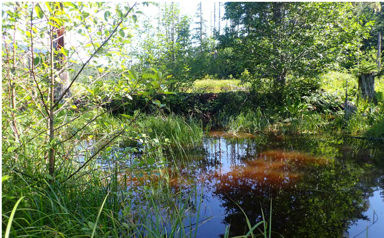
Figure 5.- Downstream side of beaver dam noted at waypoint 11.