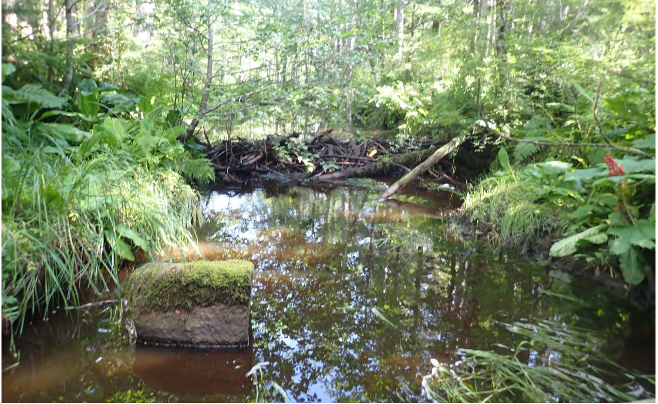
Figure 3.- Looking upstream at beaver dam noted at waypoint 8.