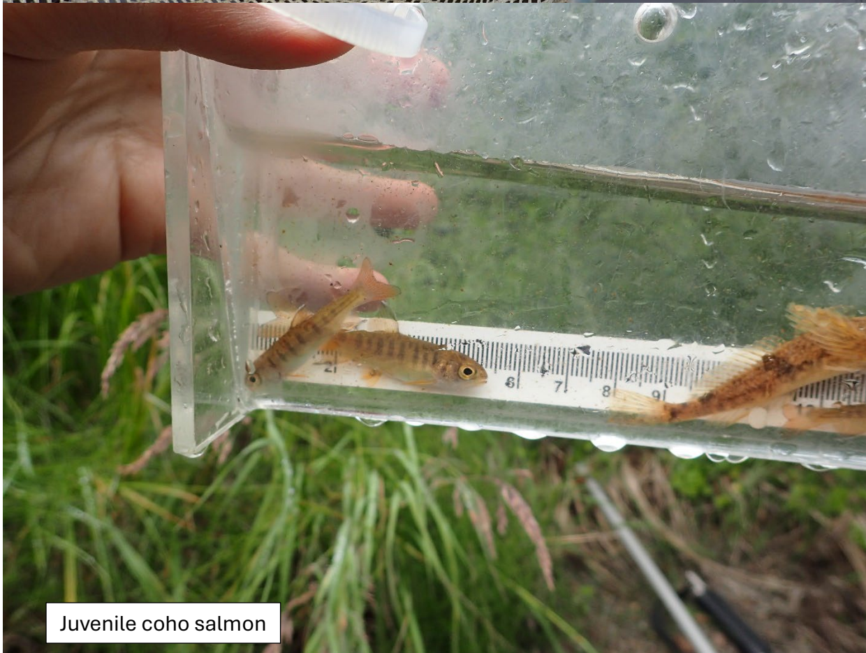
Juvenile coho salmon