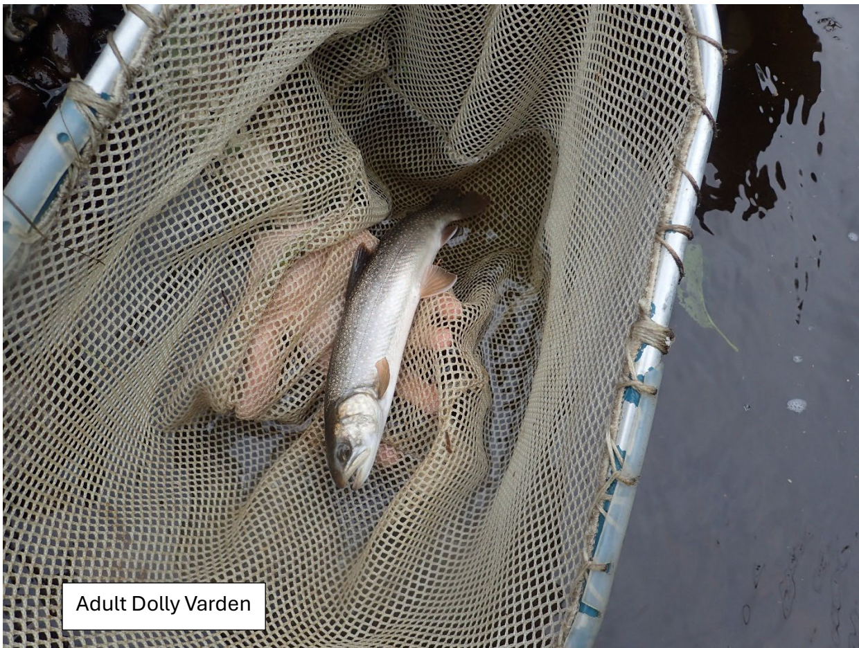
Adult Dolly Varden