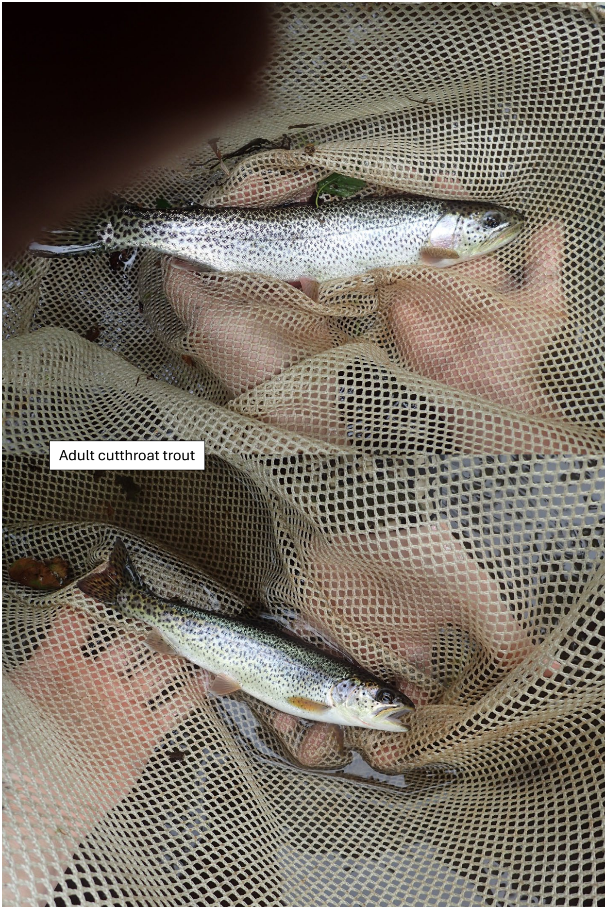
Adult cutthroat trout