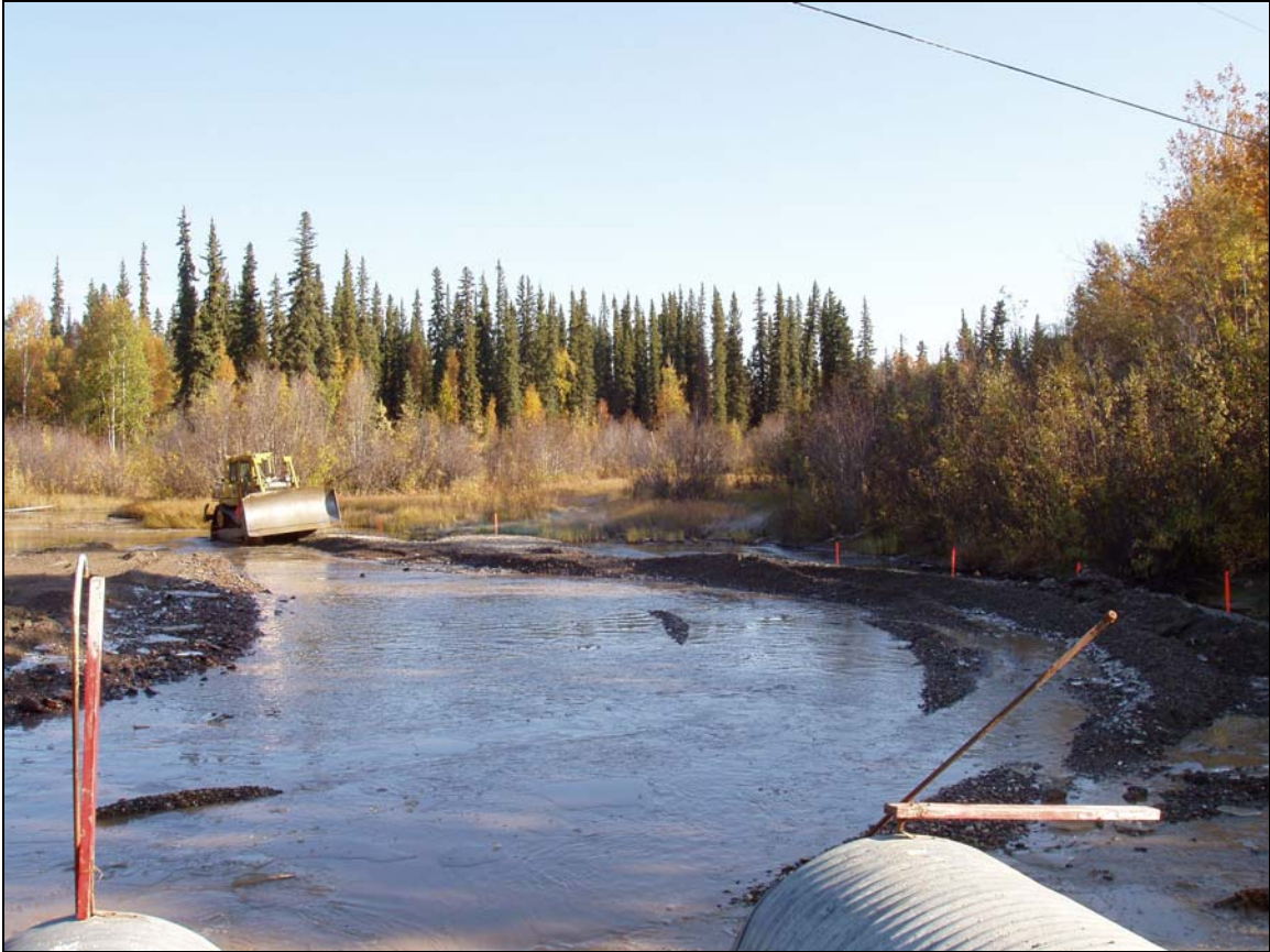
Constructing the permanent 30' wide by 3' deep channel downstream of the culverts and the bankfull bench on the left limit of the channel.