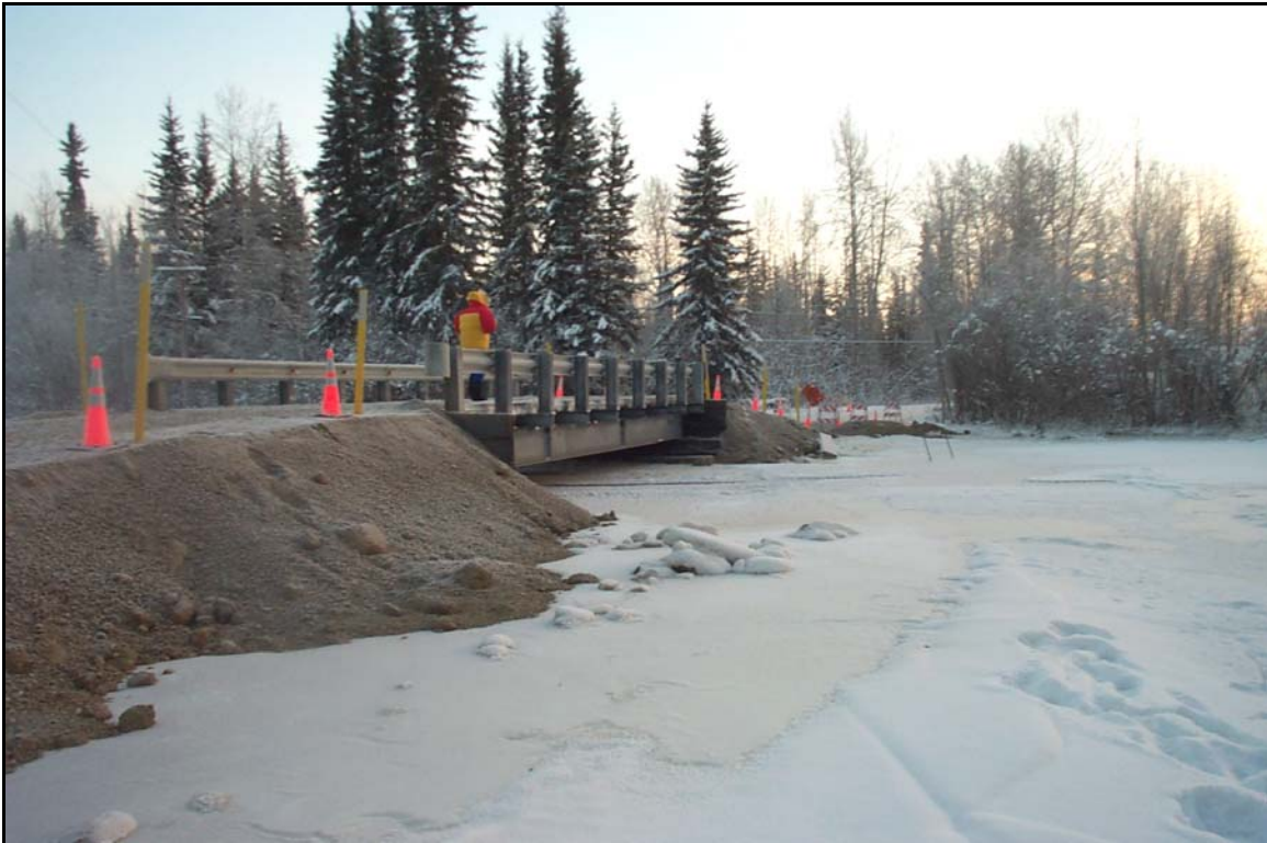
Temporary bridge over the culverts

In January 2003 extensive overflow on Piledriver Slough at the Old Richardson Highway crossing (one 5’, one 4’ and one 3’ diameter culvert existed at the crossing) made the road unusable. The ADOT/PF Maintenance and Operation (M&O) crew installed a temporary bridge at the crossing site to keep the road open and safe.