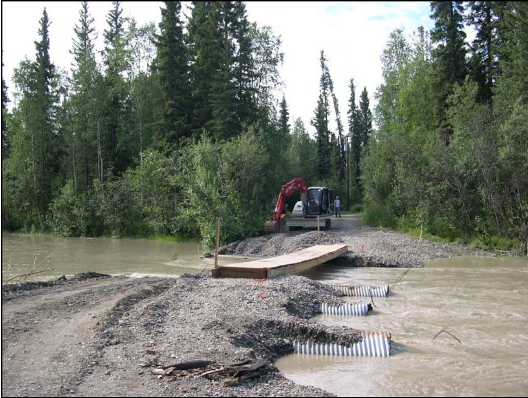
Piledriver Slough at Ingrid Road crossing

In July 2003, the Ingrid Road crossing of Piledriver Slough was washed out when water from the Tanana River inundated the slough. The subdivision was accessible only by foot for several days.