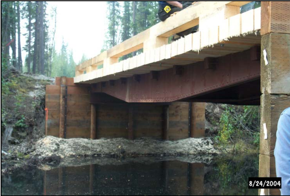
New bridge downstream from original crossing

For mitigation, the property owner removed an old earthen/grown-over/beaver dam located approximately 200 feet upstream of his original culverted crossing.