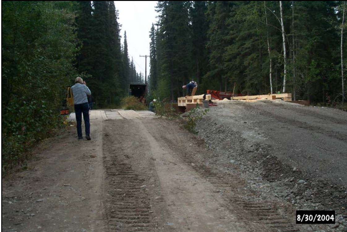
Old bridge on left, new bridge on right (over the top of the low water crossing)

In August 2004, an old (unsafe) bridge with abutments in the stream bed was removed and replaced with a free-span 40' long steel bridge (flatbed railcar) at the Bradbury Road crossing of Piledriver Slough. The residents had created a low water crossing in the stream immediately downstream of the old bridge. The new bridge was purchased and installed using USFWS grant monies.