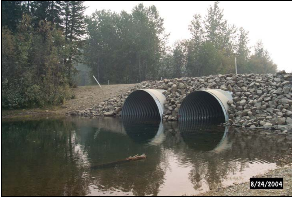
After (outlet – taken from bankfull bench)

In October 2003, ADOT/PF M&O (with funding assistance from the USFWS) removed the existing culverts, created a “permanent” 30’ wide by 3’ deep channel with a bankfull bench at the downstream left-limit of the crossing, and installed two 12’ diameter arched culverts. The ADNR-OHMP and the USFWS worked closely with ADOT/PF to design and construct the new crossing and channel.