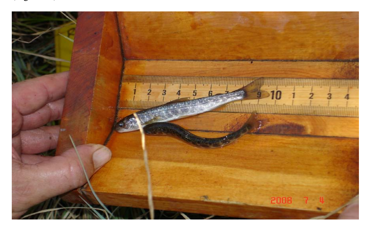
Figure 13. Juvenile Dolly Varden.

streambed and placed in each minnow trap to both hold the trap and bait in place and to provide refuge for fish caught in the trap. Traps are placed in moving water and not in backwater areas or pools as juvenile Dolly Varden prefer higher velocity water. Traps are numbered for each sample reach and are fished for 24 hours. Each sample reach is established with an upper and lower point and 10 traps are placed in each sample reach. The exact location of traps varies annually due to changes in the stream and discharge at the sample time. Individual sites are marked in the field with flagging. When traps are checked, fish are removed, identified, measured, and released back to the sample reach (Figure 13).