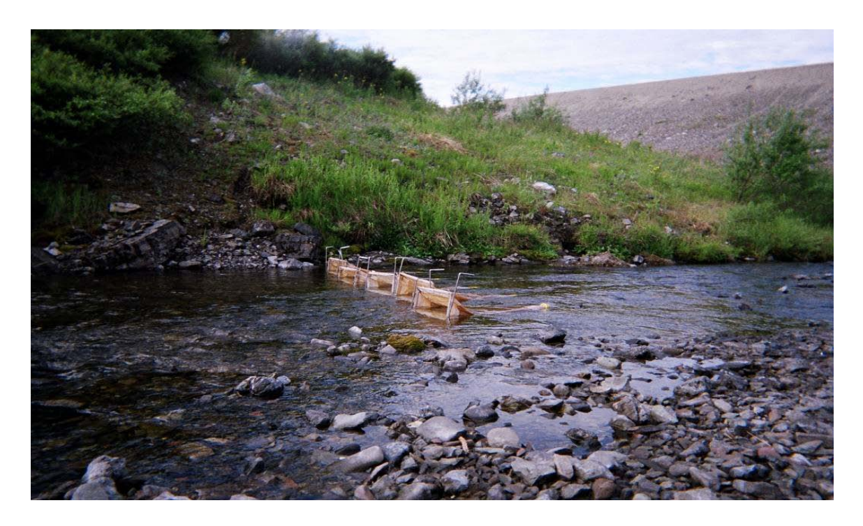
Figure 7. Drift nets in Buddy Creek upstream of Haul Road.

After 1 hr, the drift nets are removed and placed along the stream margin with the open end on the streambank and the cod end in the water to keep the sample wetted. Materials in the net are flushed into the cod end by splashing water on the outside of the net. After all debris and insects are rinsed from the net, the cod end is removed, water is decanted through the screen, and the contents are transferred to a labeled sample container. Ninety percent denatured ethanol is added to preserve the sample. Alcohol is added to completely submerge the sample material. The five labeled sample containers are then placed in a plastic bag. Samples are packaged and shipped from the field to the laboratory via an air cargo flight.