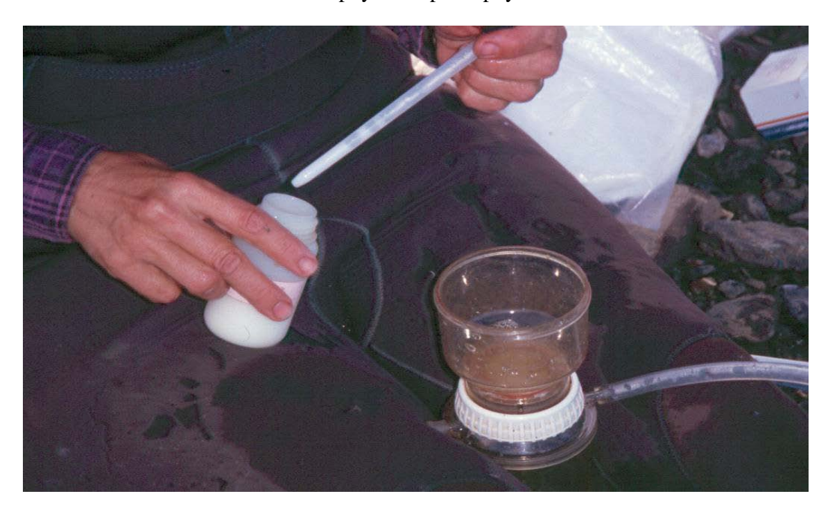
Figure 5. MgCO<sub>3</sub> is added to sample in the filter receptacle.

Water is then extracted from the periphyton sampling with the vacuum pump. After extracting most of the water (i.e., ¼ inch of water remains above the glass fiber filter), about 3 to 5 drops of saturated MgCO<sub>3</sub> is added (Figure 5). The saturated solution contains both a solid and a liquid, the bottle is shaken and the saturated liquid is removed with the eye dropper and applied to the sample; care is taken to avoid applying the solid MgCO<sub>3</sub> to the sample. The MgCO<sub>3</sub> is added while gently swirling the sample to ensure the entire sample receives a light coating. Pumping continues until the water is gone and the filter begins to wrinkle or appears dry. The MgCO<sub>3</sub> is added to prevent acidification and additional conversion of chlorophyll-a to phaeophytin.