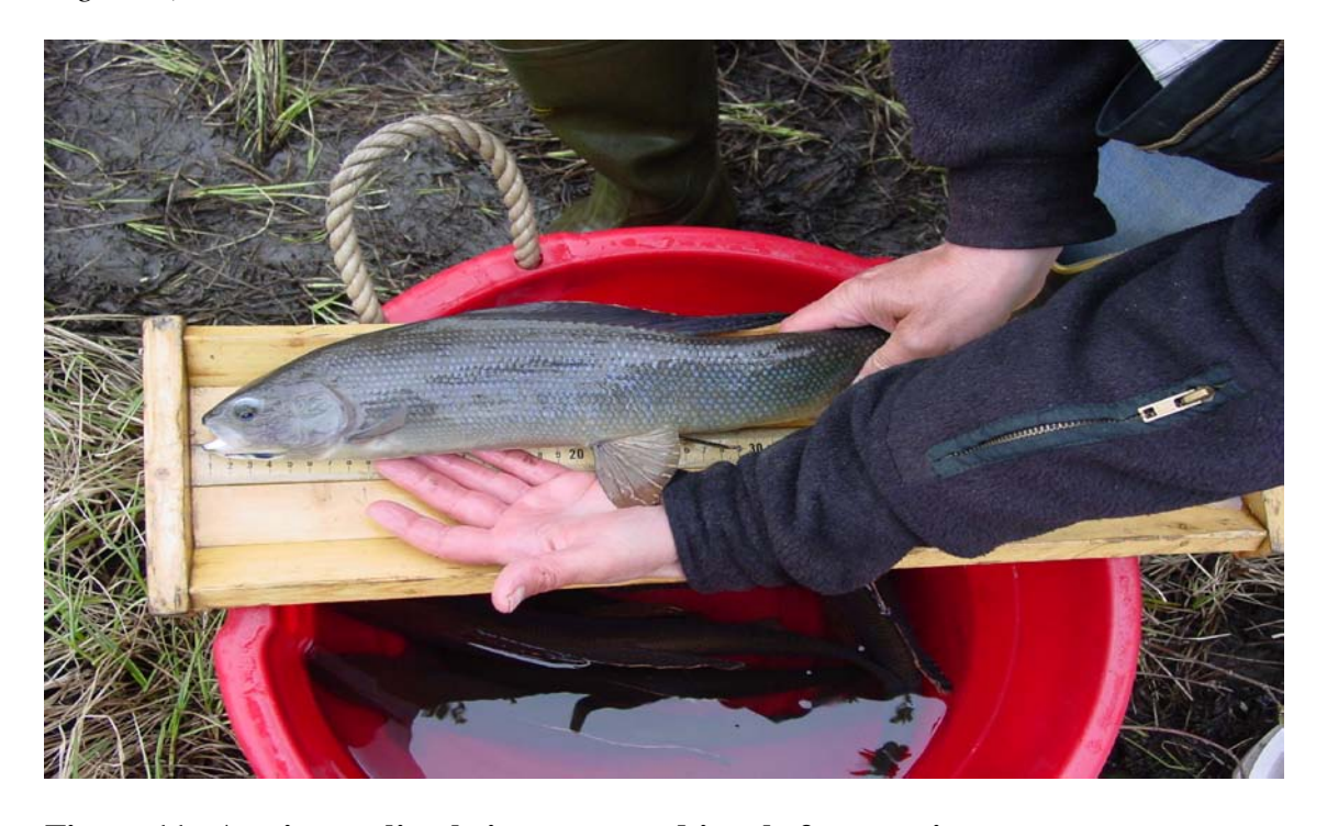
Figure 11. Arctic grayling being measured just before tagging.

The preferred sampling time for Arctic grayling use of North Fork Red Dog Creek is late May and early June to assess the spawning run of adults. Arctic grayling larger than 200 mm are marked with numbered Floy® T-bar anchor tags (Figure 11). The marking of Arctic grayling in Bons Pond follows the same protocol. Information on movements and use of various streams in the Ikalukrok Creek drainage is obtained from recaptured fish. Presence and length information on other species captured (e.g., slimy sculpin Cottus cognatus ) is recorded.