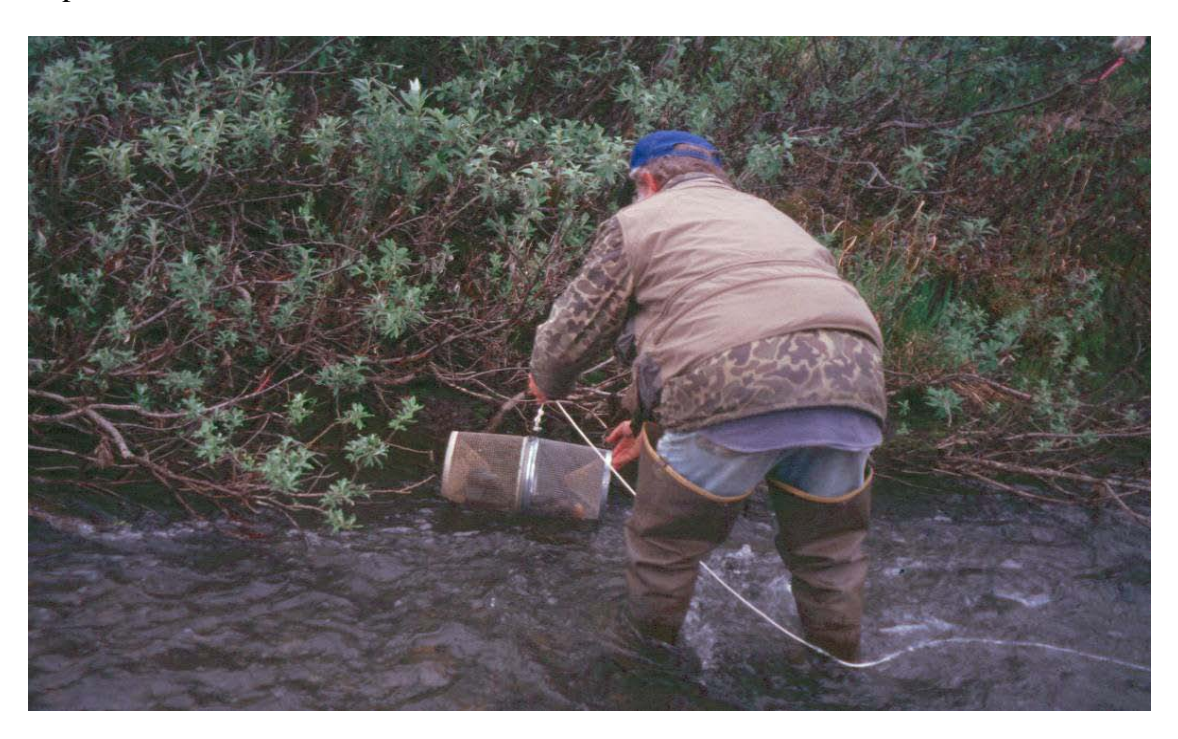
Figure 12. Minnow trap being placed in Mainstem Red Dog Creek.

Sampling for juvenile Dolly Varden occurs in late summer, typically late July to mid-August. This sampling time is based on juvenile Dolly Varden distribution and abundance peaking just prior to decreasing water temperatures associated with freezeup (Ott and Morris 2005). Sampling involves placement of 10 minnow traps per site (Figure 12). Minnow traps have been selected because they are very effective at catching juvenile Dolly Varden. Juvenile Dolly Varden are the primary target species because they are a ubiquitous species in the area and the species most susceptible to minnow traps.