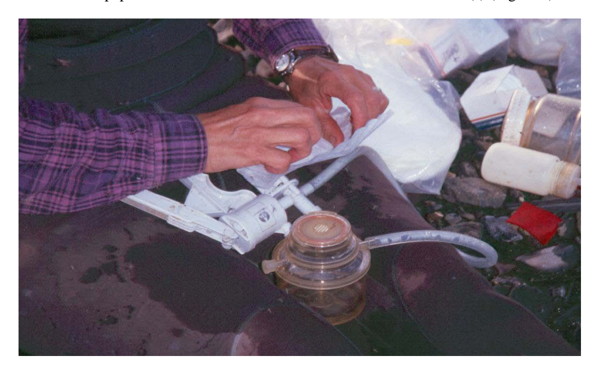
Figure 6. The folded glass fiber filter is placed in a coffee filter. The coffee filter is folded to completely cover the sample glass fiber filter.

The receptacle on top of the vacuum pump is then removed and the glass filter is folded over, placing the sample material on the inside of the filter. If two filters are used then these are placed face to face with the sample material on the inside and the two filters are folded in half. Alternatively, multiple filters used for one rock can be folded separately, as above, but must be stored together. The glass fiber filter(s) are then placed on a coffee filter and the paper coffee filter is folded to cover the entire fiber filter(s) (Figure 6).