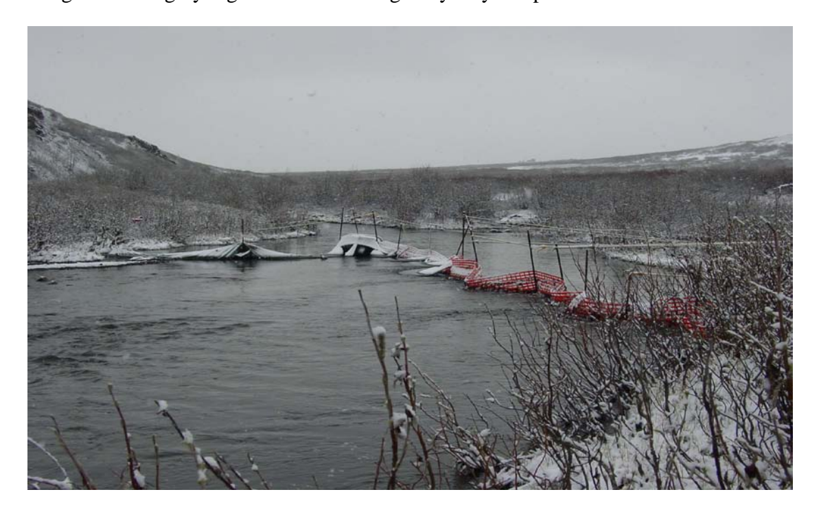
Figure 10. Fyke net in North Fork Red Dog Creek in spring, 2008.

The objectives of the fish monitoring study are to assess distribution and use of streams by Arctic grayling and Dolly Varden in the Red Dog Mine area. Fish monitoring focuses on the distribution and relative catch of juvenile Dolly Varden at selected sample sites and includes sites potentially affected by the mine as well as reference locations. We assess the spawning run of Arctic grayling in North Fork Red Dog Creek (Figure 10). Additionally, the Arctic grayling population in Bons Pond is estimated and the presence of age 0 Arctic grayling is assessed during early July sample events at all sites.