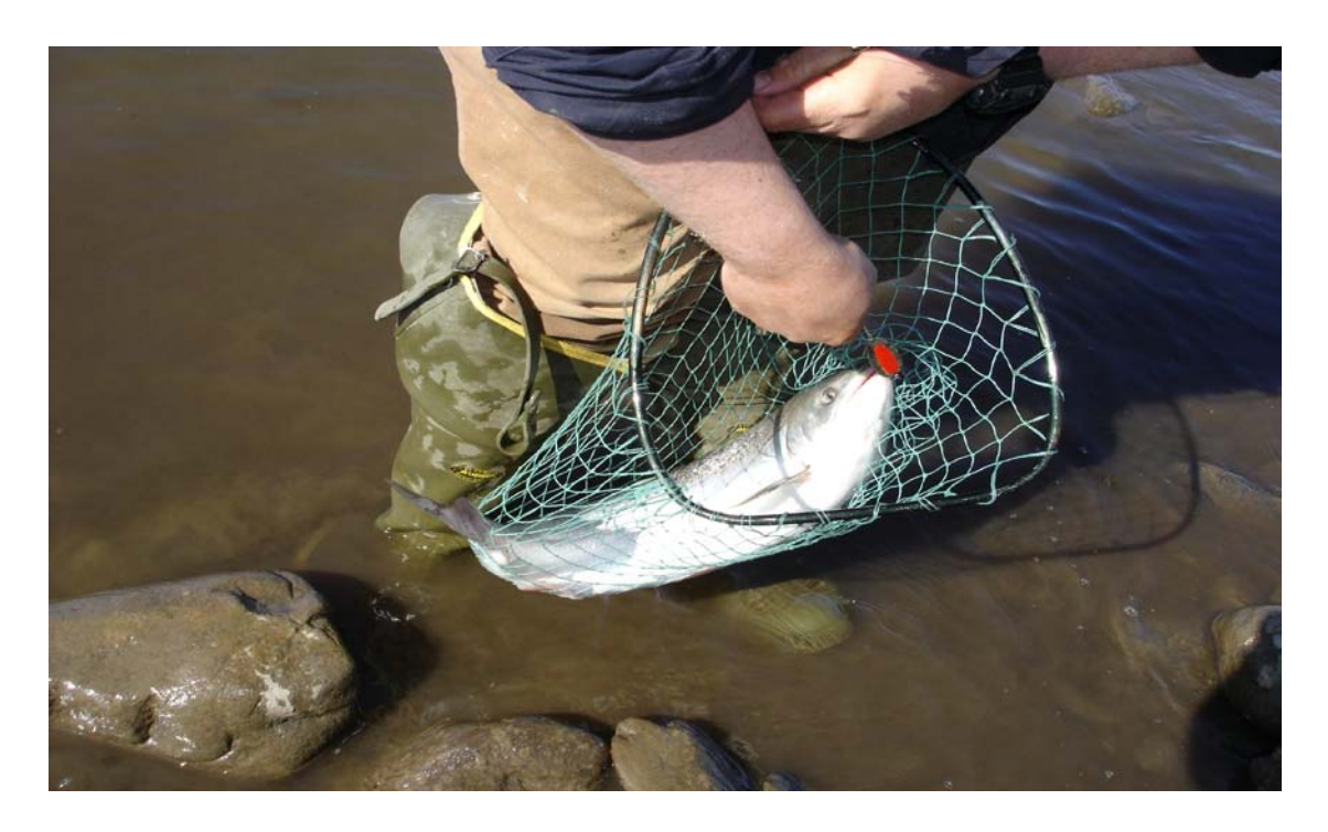
Figure 8. Dolly Varden, Wulik River near Tutak Creek, spring 2007.

Adult Dolly Varden are transported back to the mine where they are immediately frozen. The fish are then packaged and shipped frozen to Fairbanks where they are placed in the low temperature freezers at the ADF&G office. The fish are kept in a sealed cooler in the freezer at ADF&G until dissections are performed.