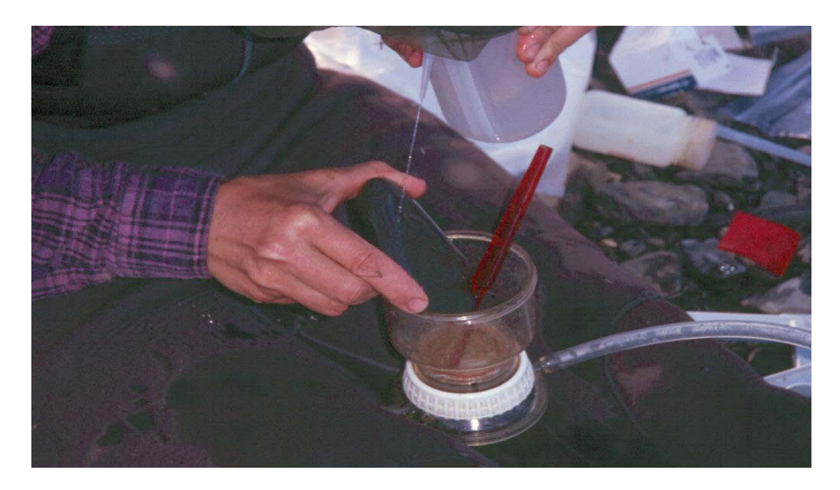
Figure 4. Removal of material from beneath the sample square and rinsing with clean water into the filter receptacle. Note toothbrush is placed in the filter receptacle since it contains part of the sample material.