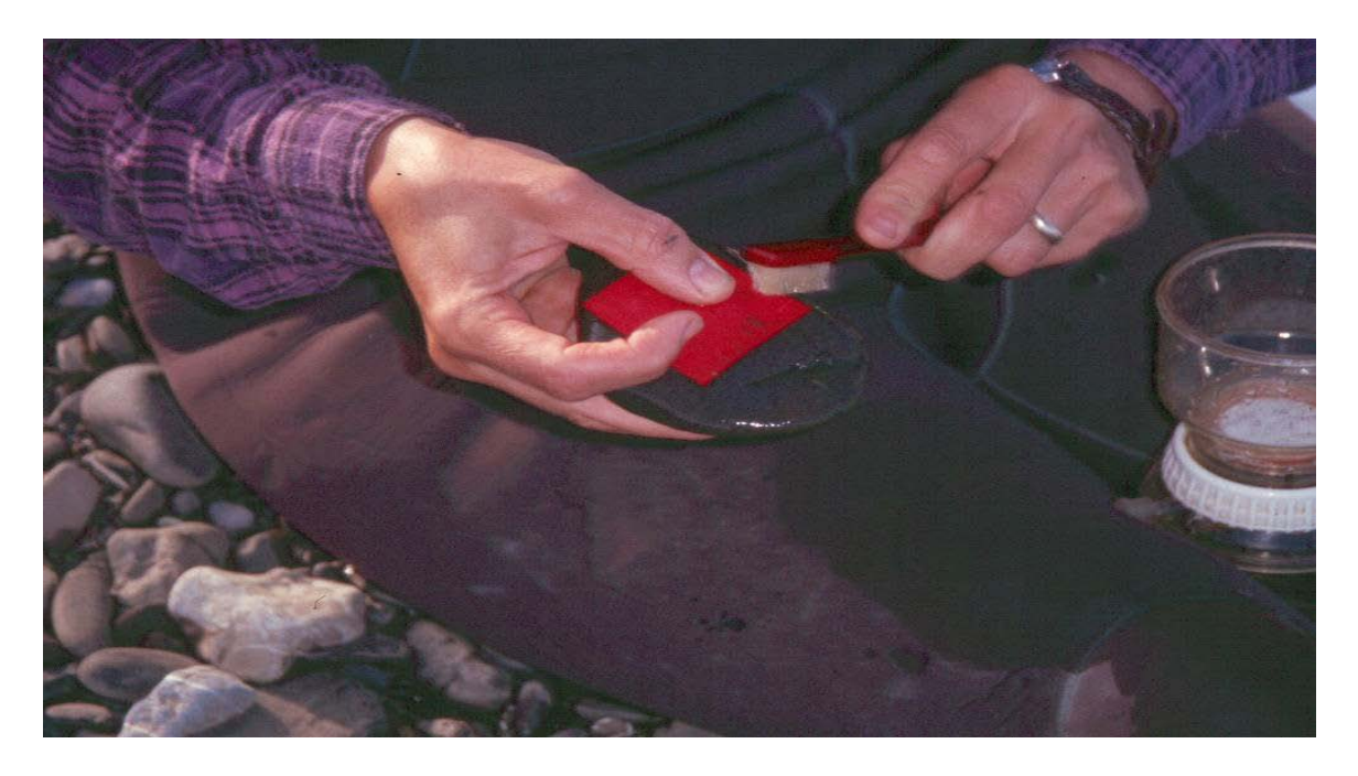
Figure 3. Brushing/removal of material from rock around the 5-cm x 5-cm flexible foam square.

cleaned toothbrush and rinsed with clean water onto a 0.45 um glass fiber filter in a filter receptacle attached to a hand vacuum pump (Figure 4).