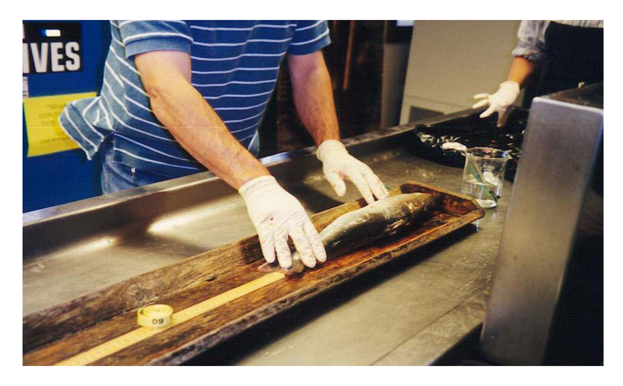
Figure 9. Measuring a Dolly Varden.

Tissue samples of muscle (below the dorsal fin and above the lateral line with skin removed), gill filament, kidney, liver (excluding bile tissue), and reproductive organs (i.e., both male and female if gonads are large enough to conduct metals analyses) are removed using standard procedures to minimize contamination (Crawford and Louma 1993). About 5 g of each tissue are placed in pre-cleaned jars supplied by the analytical laboratory (EPA Series 300, Protocol C) and refrozen. Dissection scalpel blades are stainless steel and are cleaned after each tissue with ultra pure reagent grade nitric acid followed by rinsing with reverse osmosis water.