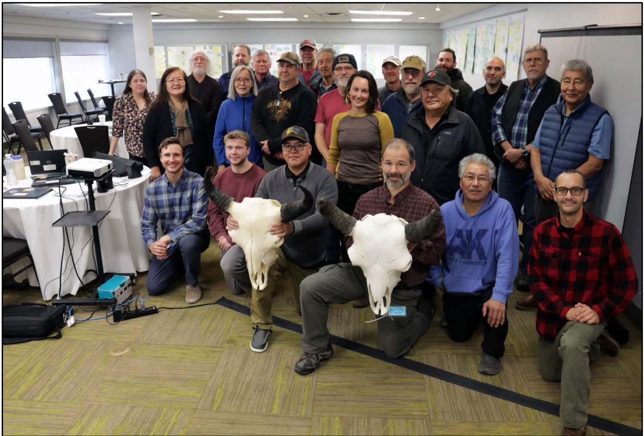
Lower Innoko-Yukon River Wood Bison Management Planning Team at the October 2022 meeting.