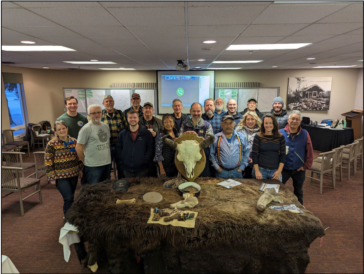
Lower Innoko-Yukon River Wood Bison Management Planning Team at the October 2023 meeting.